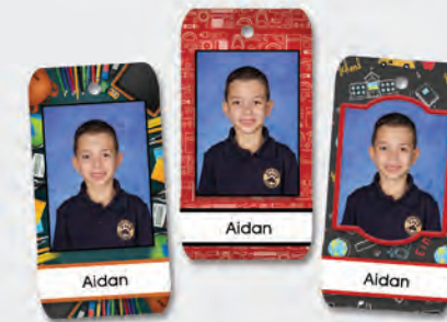
PHOTO KEY TAGS